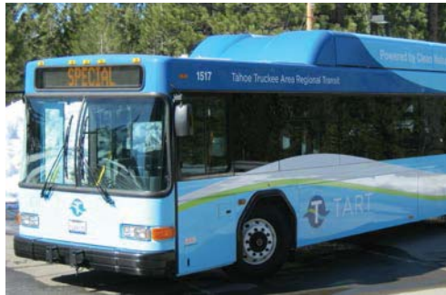
A Tahoe Area Regional Transit (TART) bus