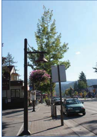
Tahoe City Sidewalks and Amenities

The National Avenue Bike Path will ultimately consist of a Class I shared use path along National Avenue from SR 28 to Donner Road. An initial segment adjacent to the Tahoe Vista Recreation Area parking area was constructed in 2012.