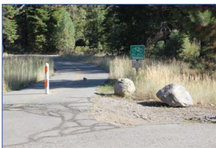
A Multi Use Trail in Tahoe City

Pedestrian and bicycle users within the Plan area are accommodated through a network of both on-road and off-road facilities. State Route 28 provides Class II bicycle lanes between Tahoe City and Kings Beach. Sidewalks are located on both sides of SR 28 in the core of Tahoe City and are currently being constructed in the core of Kings Beach.