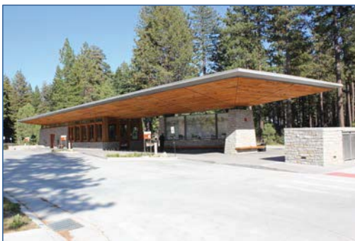
The Tahoe City Transit Center

In 2012, Placer County opened the Tahoe City Transit Center along SR 89 just to the south of the Truckee River. The transit center provides an attractive hub for various transit services, including TART, the Emerald Bay Trolley and the skier shuttles. It also provides multi-modal connectivity with bicycle lockers and park-and-ride spaces available on-site.