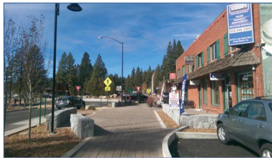
New Kings Beach sidewalks

The existing two travel lanes in each direction have been converted to one travel lane in each direction plus a center two-way left turn lane, sidewalks, and bicycle lanes. Roundabouts have been constructed at Bear Street and at Coon Street (replacing the existing signal at the latter cross-street). In addition, Brook Street has been converted to one-way eastbound and extensive water quality improvements have been constructed throughout the area.