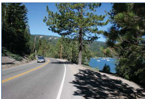
Highway 89 on the West Shore

State Route (SR) 89 serves the Truckee River Canyon and west shore, as part of the overall route connecting Alpine County on the south with I-5 in Siskiyou County on the north. As a direct all-weather road connecting the Tahoe area to I-80 and the Sacramento and San Francisco Bay areas, it carries the greatest traffic volumes into the north and west shores. SR 89 is generally two lanes in width, with additional turn lanes at major intersections. The speed limit varies from 25 to 45 miles per hour in the Plan area.