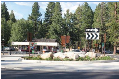
New roundabout in Kings Beach

This Transportation Plan is intended to provide an efficient circulation system for all users, with a focus on improved pedestrian, bicycle and transit options in accordance with the Regional Plan and with the 2012 Lake Tahoe Sustainable Communities Strategy (SCS) that was adopted in accordance with California Senate Bill 375 (Sustainable Communities and Climate Protection Act).